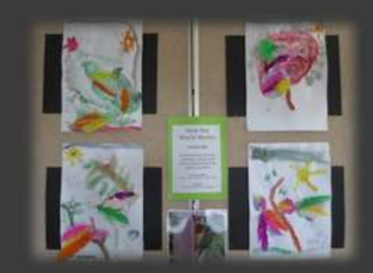
Creative Work Displayed