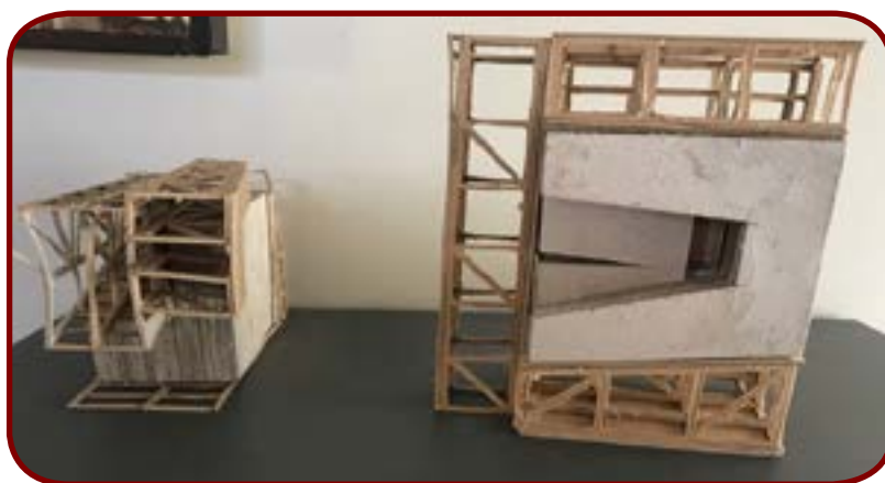
Construction by Nicholas Thomas

Teachers tried hard to ask questions that were more complex than those that focussed only on colour and shape. However, they were also aware that sometimes questions and discussions about these elements of art can be useful starters of conversation about art works.