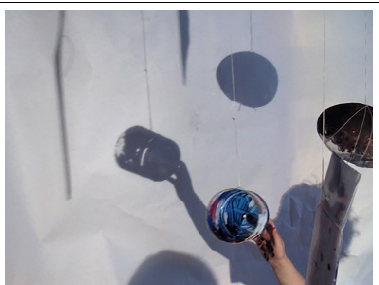
Figure 4. Illuminated and moving objects

Back in the preschool atelier, the two children showed photographs and described their experiences of visiting the exhibition. One of the crucial things for the two children was the concept of an exhibition, so they suggested constructing an exhibition and inviting peers and guardians to it. This suggestion led to the first aesthetic event after the visit to the art museum. The two children and the invited peers painted transparent objects with acrylic paint, which were later hung from the ceiling and illuminated. When the exhibition was to be shown, two essential ingredients were to illuminate the created objects and make them move so that their shadows rotated (Figure 4). The museum visit remained an active memory for the children for at least eight months. The children who had not been to the exhibition talked about it, wanted to continue working with inspiration from it and retold visual events from the exhibition as though they had been there.