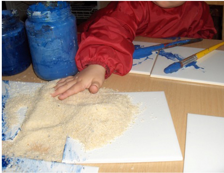
Figure 1. Sara and the breadcrumbs